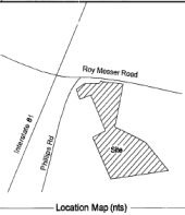
Location Map (1/8)